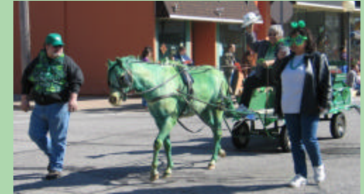
St. Patrick's Parade—March 15, 2008