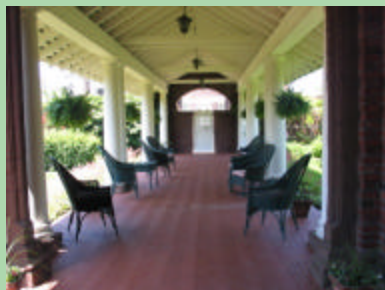
Historic Barker Mansion

You'll never forget all that you discover in Michigan City.