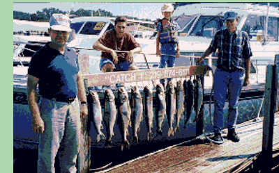
Charter Fishing Available at Marina